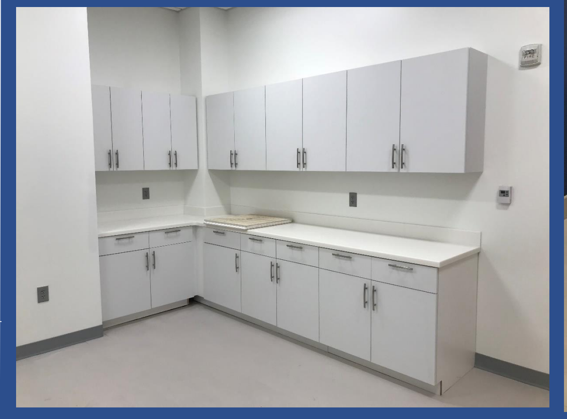
Completion of Millwork, Base and Electrical Trim Out