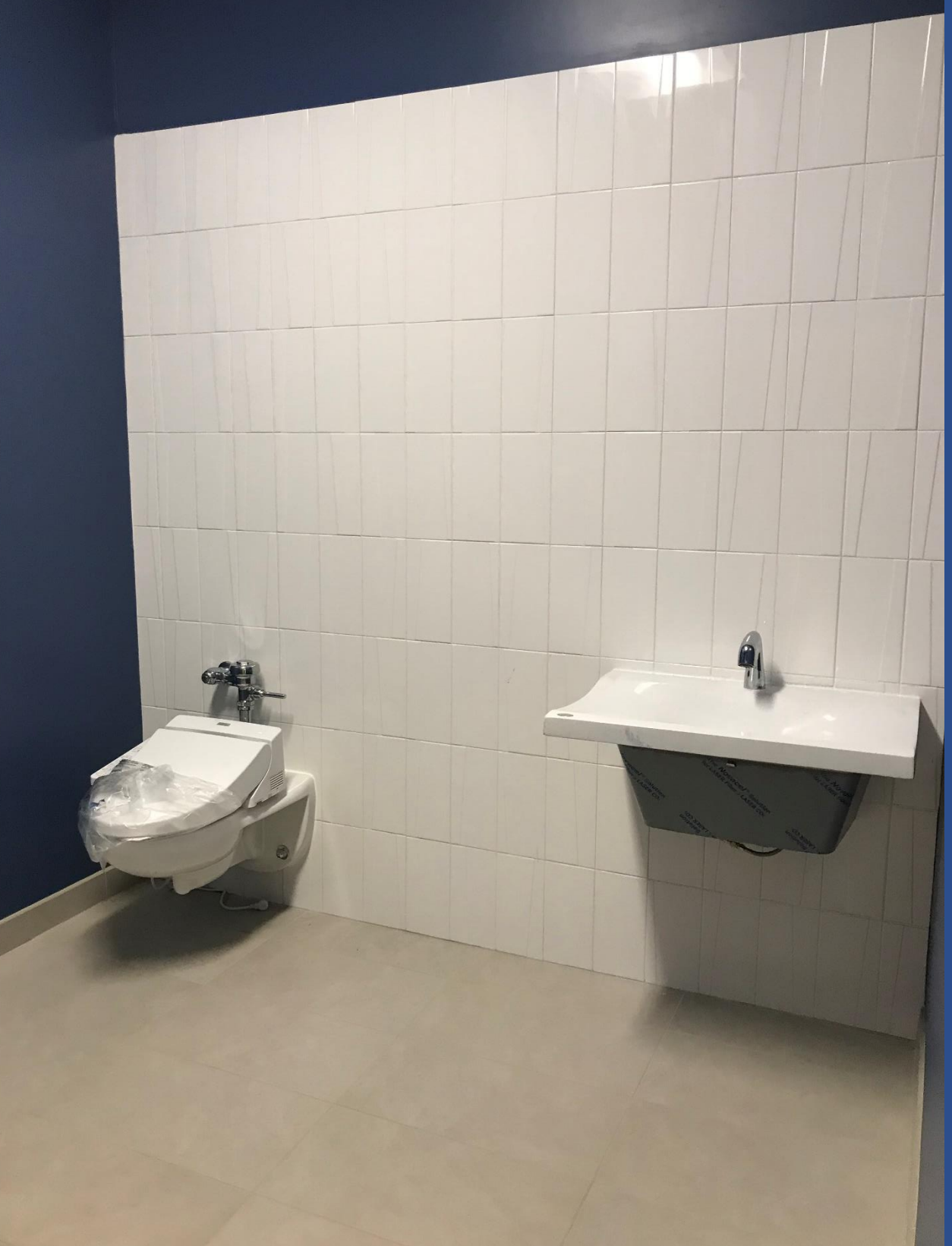
Dean Suite Bathrooms