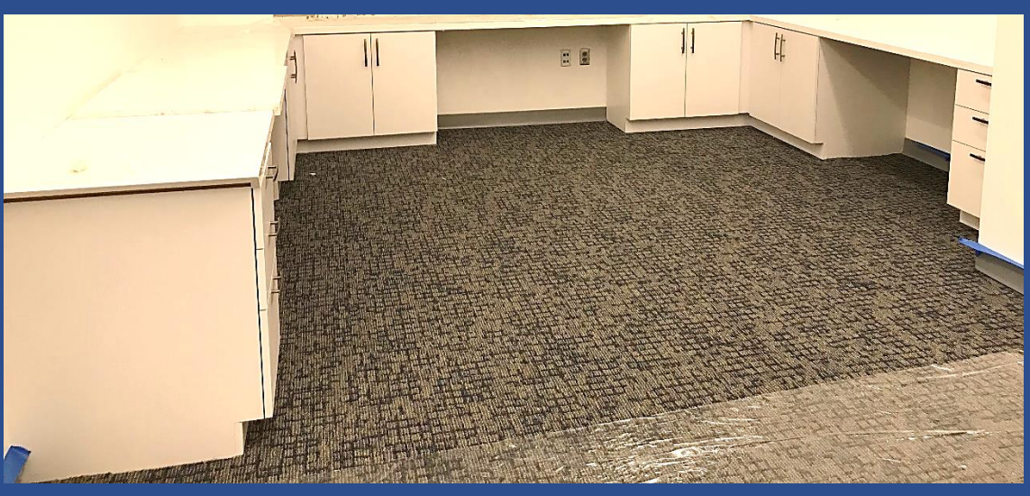
East Side Reception Millwork