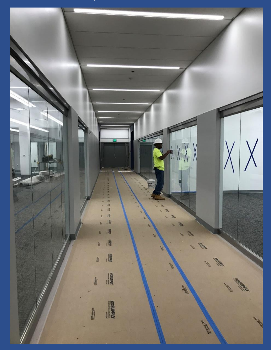
East Corridor Final Paint and Base