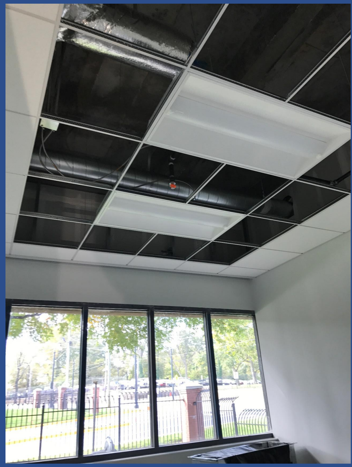
Install of Office Light Fixtures