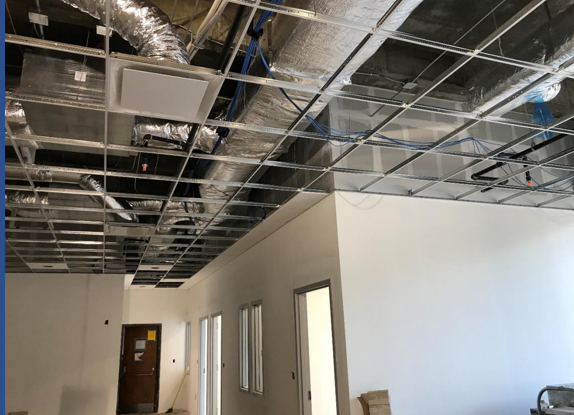
Install of Ceiling Grid & O/H MEP