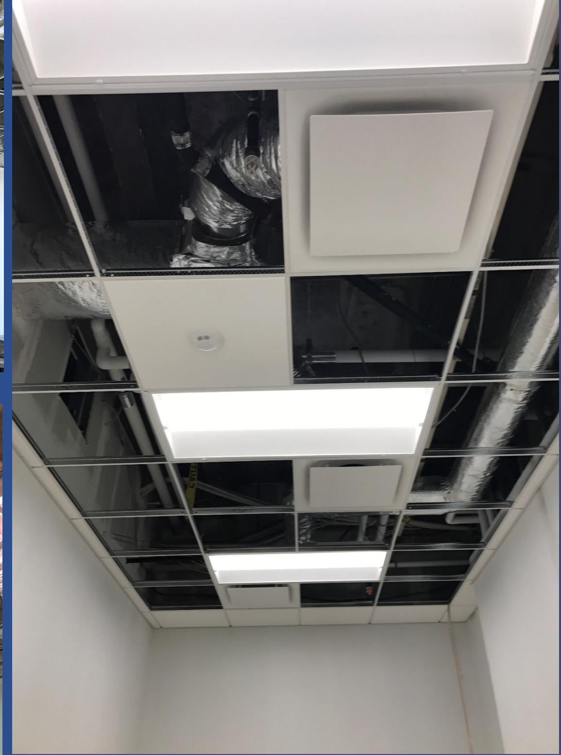
Install of Light Fixtures and Diffusers